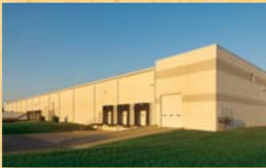
NorthWind Crossings Building C, Hobart, IL