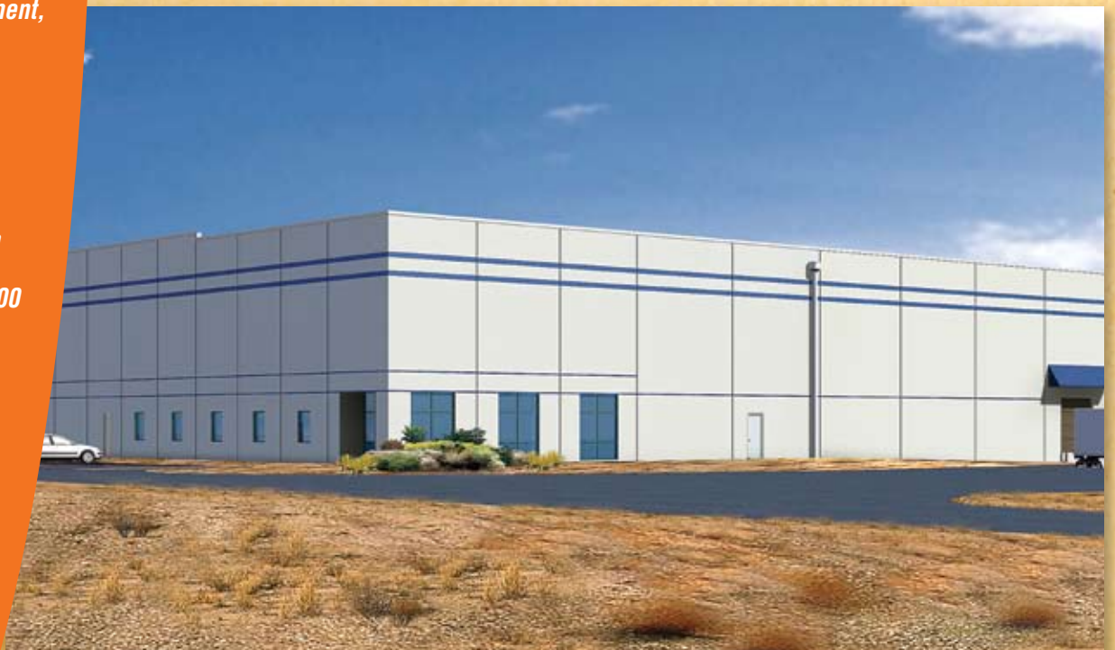
The park's first facility is a 330,000 SF distribution center for Dallas, TX-based Freeman.

High-volume water users can access Mohave Tri-State Business Park's water rights through 12-inch water lines, which, according to the treaty within the Colorado River jurisdiction, allowing for seven acre feet or 2,275,000 gallons per acre per year, which is sufficient to support a bottling operation or manufacturing plant. In addition, there are on-site wells capable of supporting ESFR sprinkler systems in all Mohave Tri-State facilities.