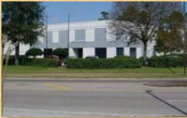
Nabisco, Jacksonville, FL