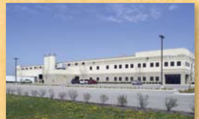
Xten Industries, Kenosha, WI