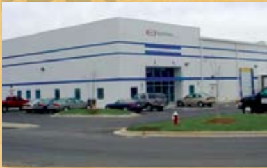
Kraft Foods, Orlando, FL