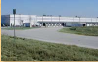
CRSA, Augusta, GA