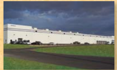
Hoffman Productions, Kingman, AZ