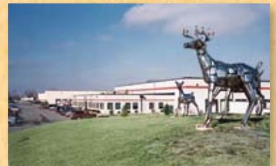
Staley General, Munster, IN