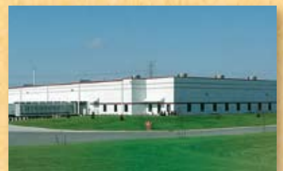
TRW, Toledo, OH