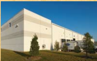
Excelsior, Hobart, IN