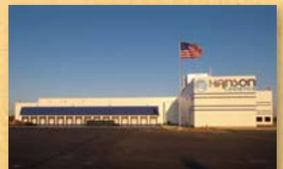
Hanson Logistics, Hobart, IN