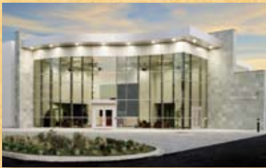
Northrop Grumman, Redondo Beach, CA