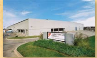
Nabisco, Irving, TX