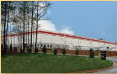
Haworth Furniture, McDonough, GA